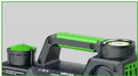
Li-ion battery powered