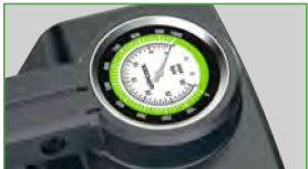
Overhead vacuum gauge