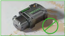
Anti-dumping oil leakage