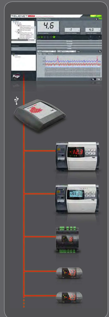
Screenshot demonstration of TeleNET monitoring system