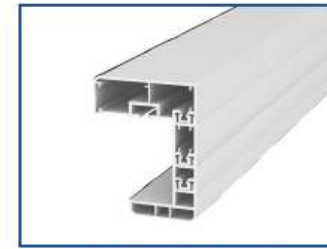
PVC frame for sandwich panel