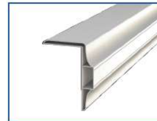
Aluminum frame for Brick wall