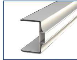
Aluminum frame for sandwich panel