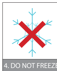
4. DO NOT FREEZE

Do not dilute. Spray onto pipework and adjacent surfaces, or components to be protected, using a fine or coarse spray as appropriate. For best results, ensure coating is as thick and even as possible.