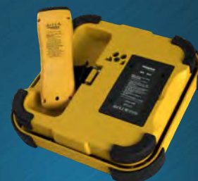
Remote stores safely in platform