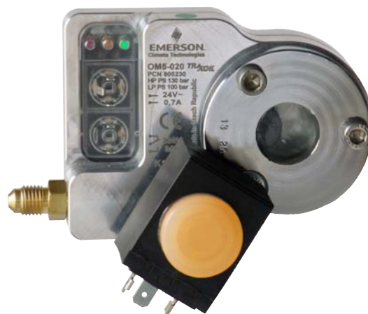
OM5 130 bar