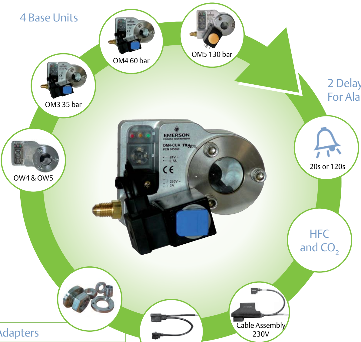
OM4 60 bar